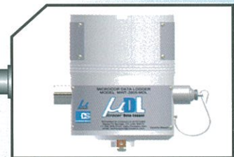
Microcorr Data Logger