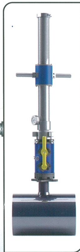
Magnetic Retriever & Double Block Valve